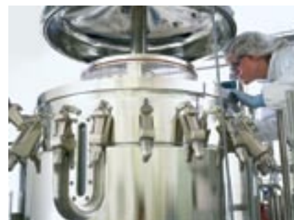
CAMBREX BIOPHARMACEUTICAL MANUFACTURING SERVICES ( WWW.CAMBREX.COM/CONTENT/BIOPHARM/BIOPHARM.ASP )

Sterilants: Table 1 summarizes key properties of oxidizing biocides to consider in choosing a sanitizing/sterilizing agent. As shown, CD is not as aggressive an oxidizer (oxidation potential data) as chlorine, ozone, peracetic acid, peroxide, or bleach — and it should be noncorrosive to common materials of construction. A high oxidation capacity (seeking five electrons rather than two), however, suggests that CD is a most efficient reagent when oxidation proceeds to completion.