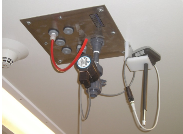
Ceiling Plate (Part #: PLAT-CEIL/PR/RH-001) Unit Dimensions: 13.0" x 13.0" Unit Weight: 13 lbs

The Ceiling Plate can be configured with a Pressure Relief valve for rooms where pressure build up may be an issue, such as BSL3-Ag facilities and other extremely tight rooms.